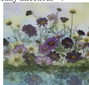
Figure 3. Dried Flower Artwork in Cool Tones

create a warm and romantic atmosphere (see Figure 4). This color coordination and contrast make dried flower art more visually striking and artistically infectious [4].