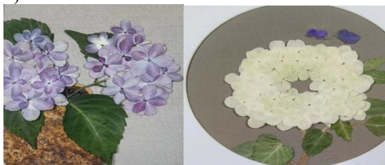
Figure 2. Collaged Hydrangeas

In the creative process of dried flower art, the forms of flowers are often reshaped and recreated. Artists use techniques such as cutting, bending, and splicing to combine dried flower materials into artistic works with new forms and meanings [3]. This reshaping and recreation of forms not only endows dried flowers with new life and significance but also makes them important carriers for expressing emotions and ideas. For example, dried hydrangeas are cleverly collaged and reshaped to mimic their original appearance in nature or arranged in vases. This reshaping and recreation of forms makes dried flower art more expressive and captivating (see Figure 2).