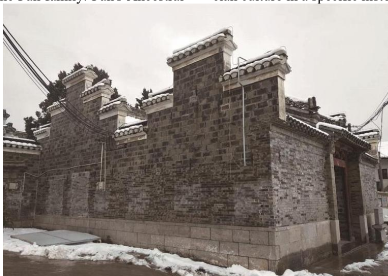
Figure 1. Pan's Ancestral Hall in Shecun Community

Hall was an important symbol of family unity and cultural heritage and has carried multiple functions during the course of family development. This is no less a place of religious worship but also a discussion center when important family issues are tackled. Ancestral hall construction shows not only the rise in social status but also an epitome of changes that outline historical events [3]. From the building and expansion to the gradual formation of scale, the historical evolution of Pan's Ancestral Hall reflects the role played by local clans in social development and at the same time reflects the integration and interaction of local culture and clan culture in a specific historical period.